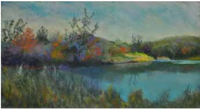
Cameron Park Lake